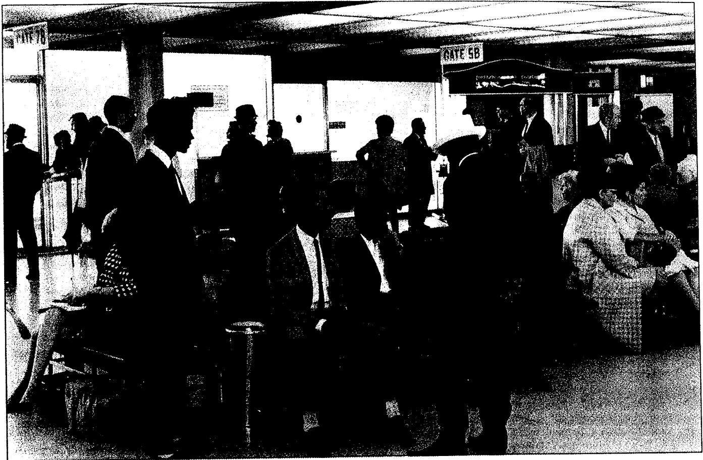
Figure 3. Waiting for a flight to Puerto Rico at Kennedy's Pan American terminal.

eight across. Your father waves goodbye at the terminal in San Juan—you sleep a little—and you are hugging your grandmother at Kennedy. What it's most like is a trip on an elevator—there's one world, the doors close, you stand there, the doors open and there's another world: What image do you have of the space you've passed through? Or even the distance you've travelled?