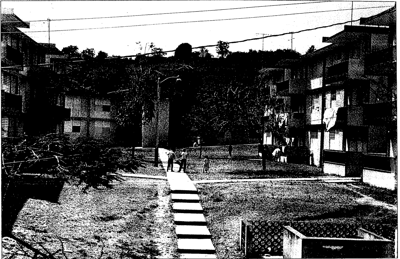
Figure 1. The Caserio in Barranquitas in 1969.